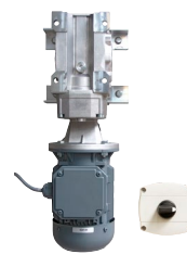
Pulling system with manual control