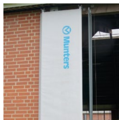
MSC wind protection set