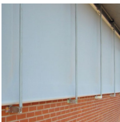
MSC wind protection pipes set