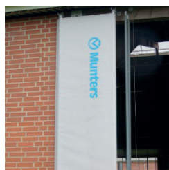
MFP wind protection sets