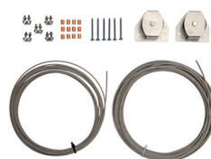
MFP / MVP extension-kits wire 6 m