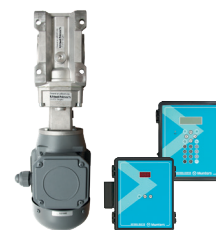
Motor drives with automatic control and emergency stop